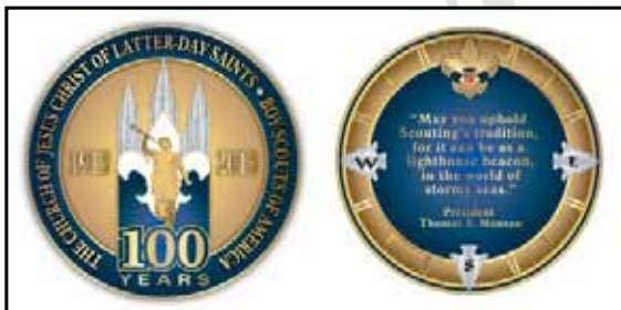
Centennial Coin Double-sided 1 3/4" coin with quote "May you uphold Scouting's tradition, for it can be as a lighthouse beacon, in the world of stormy seas. "...